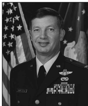
Col. Charles DeBellevue

The Black Heritage Gallery will exhibit Fulton's portraits through Dec. 31. Gallery hours are 8:30 a.m. to 5 p.m. Monday-Friday. For more information, call 337.488.0567.