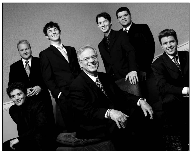
The Kingsmen Quartet